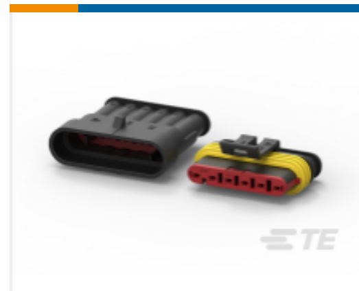
TE Part #282080-1 AMP SUPERSEAL 1.5MM, CONNECTOR HOUSING