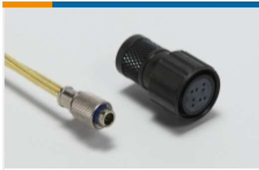
Standard Circular Connectors(199)