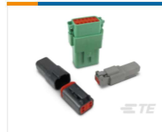
TE Part #DT04-2P DEUTSCH DT Series Housings & Connectors