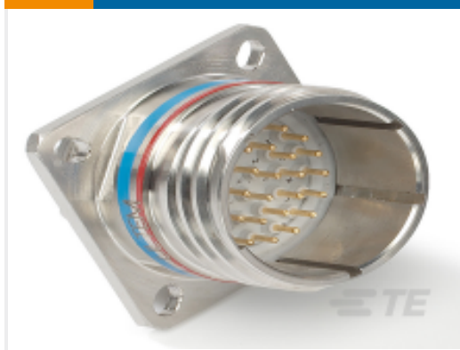
TE Part # CAT-D38999-DTS4C D38999: Square Flange, 25-19 insert