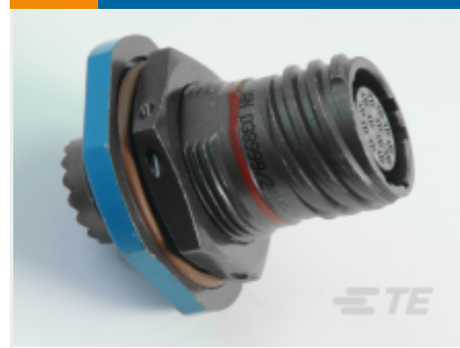
TE Part # CAT-D38999-DTS12R D38999: Jam Nut, 25-19 Insert