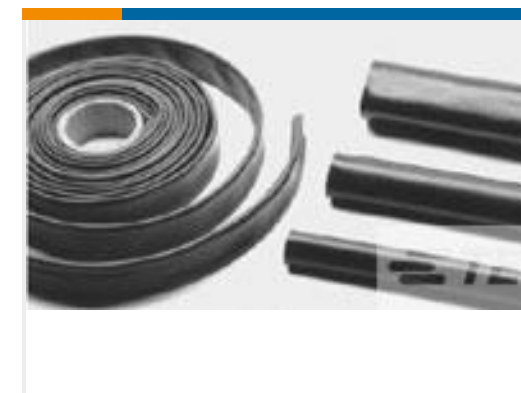
TE Part #CS8624-000 BSTS-15X4FR/NM