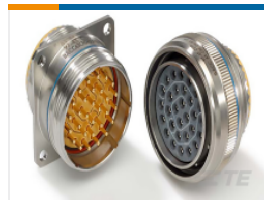
TE Part #ZPF0000000000035089 983-6KE 08-98 SN