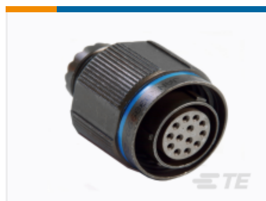
TE Part #YDTS26G23-53PAV001 PLUG ASSY