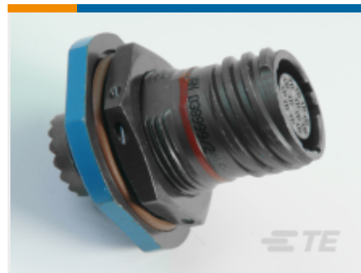
TE Part # CAT-D38999-DTS12G D38999: Jam Nut, 19-35 Insert