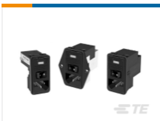
TE Part #1-6609106-3 CORCOM P SERIES MULTI-FUNCTION INLET FIL