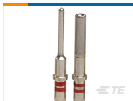
TE Part #ZPF000000000001261 097-0267-16 A1267