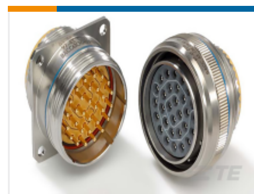
TE Part #ZPF0000000000035089 983-6KE 08-98 SN