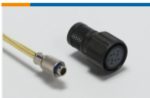
Standard Circular Connectors(33079)