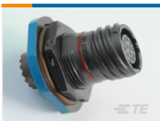
TE Part #YDTS24G23-55BDV001 D38999: Jam Nut, 23-55 Insert