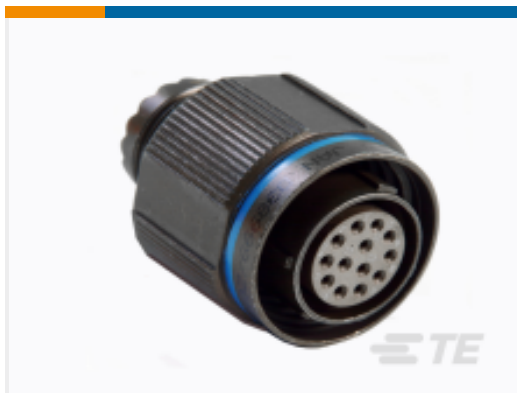
TE Part # YDTS26G19-35PEV001 PLUG ASSY