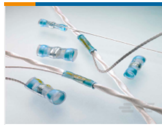
TE Part #EJ3518-000 S200-2-55-20-9CS2904