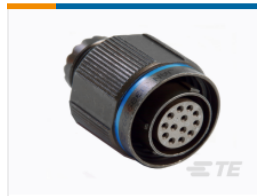
TE Part #YDTS26G15-05SNV001 PLUG ASSY