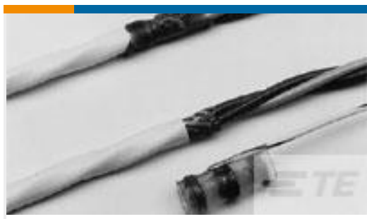
TE Part #CR0178-000 CWT-7-W116-9