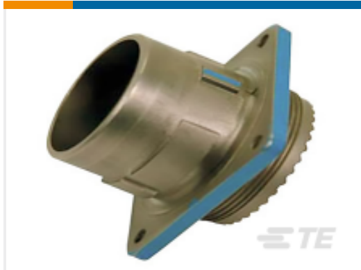
TE Part #YDIV43E13-35PAV001 RECP ASSY