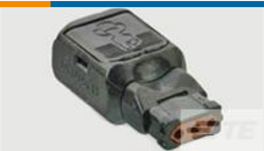
TE Part #D369-R33-NS1 369 3 WAY REC, CRIMP, SKT