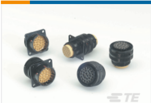
TE Part #ZPF000000000019306 FDBA 56-14-19 SN-K 090