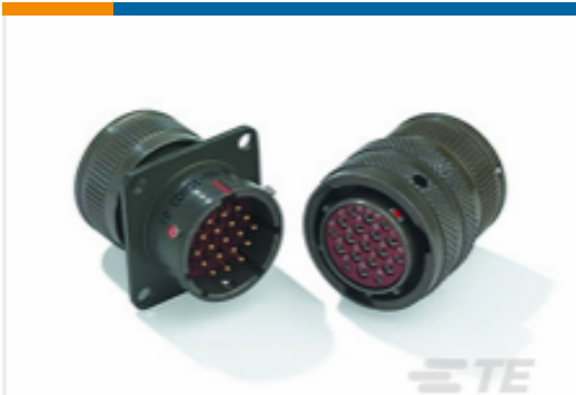
TE Part #ZPF000000000122870 951-06 R 18-800 S 50-090