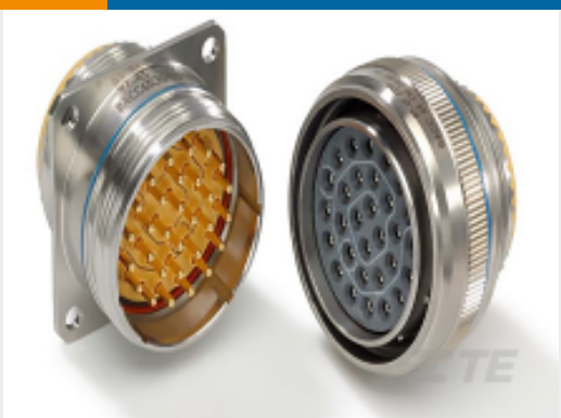
TE Part #ZPF000000000008401 983-6RS 10-05 SN-L