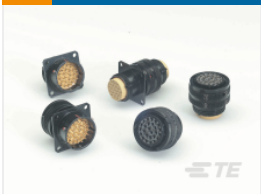
TE Part #ZPF000000000019928 FDBA 57-14-19 SN-K 090 A838