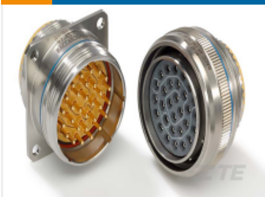
TE Part #ZPF000000000008944 983-6SE 20-04 PN-L