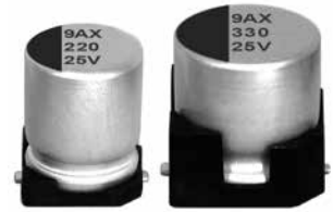
Marking color : Blue print