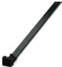
Cable binders ideal for temporary fastening, with locking release, removable

Please be informed that the data shown in this PDF Document is generated from our Online Catalog. Please find the complete data in the user's documentation. Our General Terms of Use for Downloads are valid ( http://phoenixcontact.com/download )