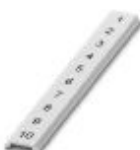
Zack Marker strip, flat, Strip, white, labeled, Printed vertically: consecutive numbers 1 ... 10, 11 ... 20, etc. up to 91 ... 100, mounting type: snap into flat marker groove, for terminal block width: 5 mm, lettering field size: 5.15 x 5.15 mm, Number of individual labels: 10

Zack Marker strip, flat - ZBF 5,QR:FORTL.ZAHLEN - 0808697