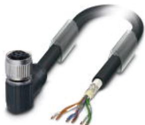
Bus system cable, VARAN, 6-position, PVC, black, shielded, cable length: 12.5 m, Customer version

Please be informed that the data shown in this PDF Document is generated from our Online Catalog. Please find the complete data in the user's documentation. Our General Terms of Use for Downloads are valid ( http://phoenixcontact.com/download )