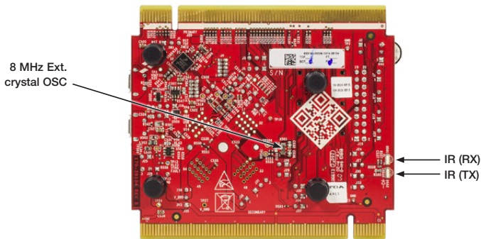
Figure 2: Back side of TWR-KL43Z48M module