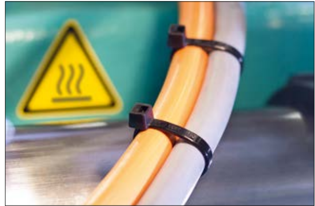
Heat stabilised T-Series cable ties up to +105 °C.