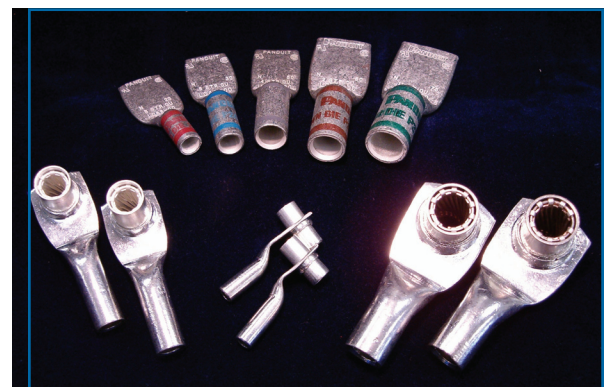
Industry Standard Color Coding