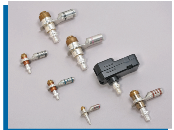
4 Sizes, 7 Ampacities (see table on back)