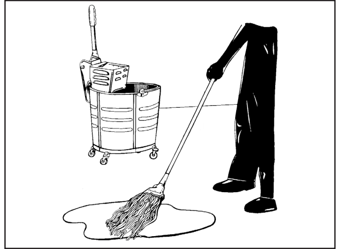
Figure 2. Applying the Statguard® Low Residue Floor Stripper with a cotton mop