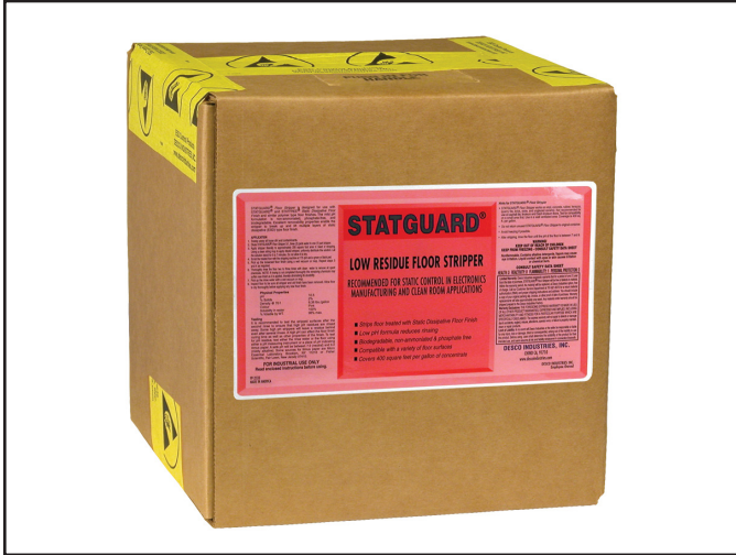
Figure 1. Statguard® Low Residue Floor Stripper